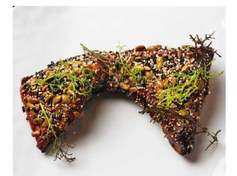
Buri Colla – Carrot Escabeche, Yuzu Mayo, Puffed Grains

Many chefs may know how to serve Buri in a raw style like sushi or sashimi. I highly recommend chefs to serve Buri in a cooked style since it has rich umami and a strong taste.