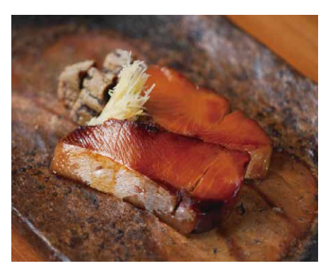
Grilled Wild Japanese Buri, Dried Persimmon "Hoshigaki", Ginger

The quality of the fish is high and consistent, which is convenient for restaurants. You can purchase an entire fish instead of fillets and serve it crudo and the collar as grilled fish. In this way, you can minimize the amount of waste. Compared to salmon, the fish has fewer bones, which makes it easier to cook and eat.